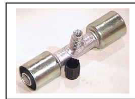
401222 #12 Lo Side

Method Two: Install fittings that have the service ports.