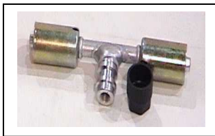
401216 #6 Hi Side

Method One: Cut the rubber hose and properly crimp the fitting in place.