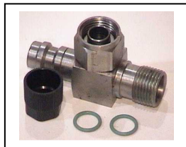
402101 3/4 x 16 Hi Side

Please refer to the SANDEN rear head identification in your Illustration Catalog to determine the fitting to use on your compressor.