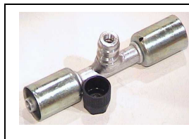
401218 #8 Hi Side