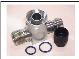
402105 1x14 Hi