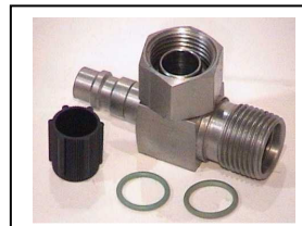
402102 7/8x14 Lo