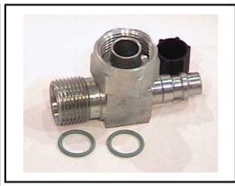
402106 1x14 Lo